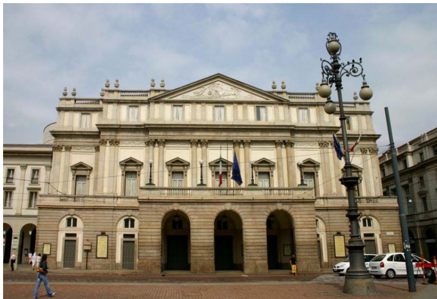
La Scala Milan