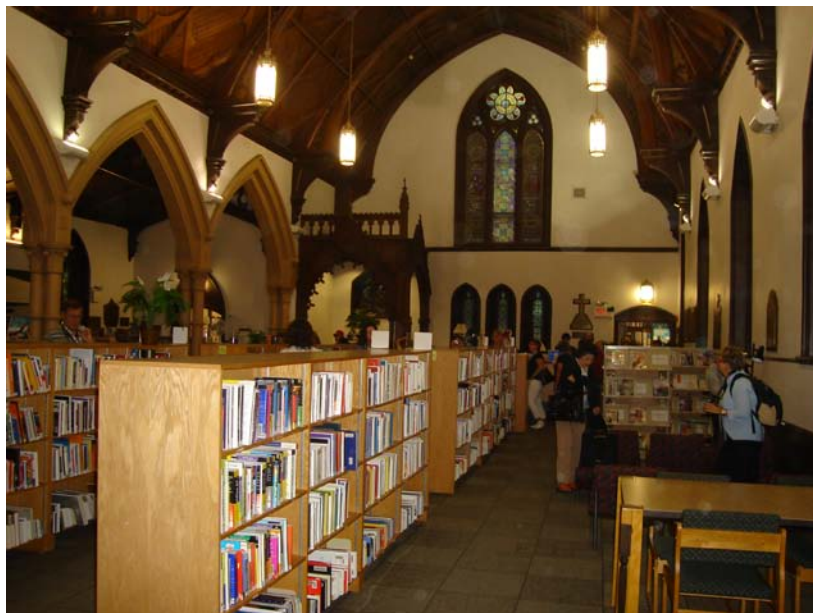
Quebec Library in an Anglican Church

Thursday was visit day and I had a good time visiting the converted churches at Levis and at the old Anglican church in Quebec itself.