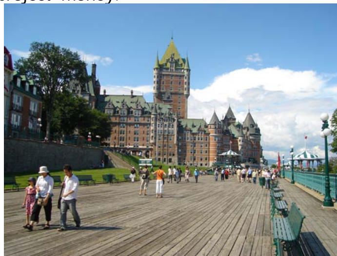
Boardwalk in Quebec

So after the family wedding in Saskatchewan on the Friday I dashed across Canada to arrive at the Public Library Section meeting on Saturday a mere 45 minutes late. I had good reason to make sure I made the meeting as I had invited a librarian from Burkina Faso to attend and present her case to be the second recipient of the sections 'Caterpillar project' money.