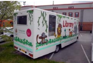
Mercedes-Benz Delegate's Choice Award: and Best Livery Award North Tyneside Mobile Library