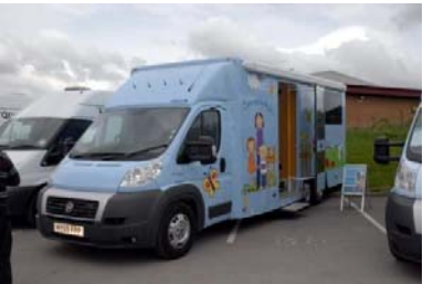
Oxfordshire's Children's Van

At the crack of dawn on 8 May 2010 the members of the Branch and Mobile Library Group (BMLG) had a quick breakfast and set off in convoy to the Rams Arena, home of Dewsbury Rams Rugby League Club. Posters and guidance were set up, chairs laid out and the IT system set up. Soon mobile libraries and delegates were arriving.