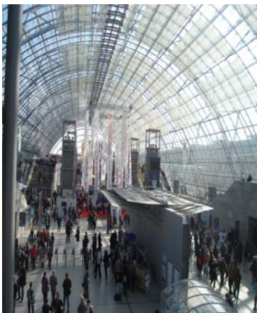
One of the biggest book fairs in the world!

The Public Library Section's mid term meeting had to be cancelled (see President's report). I had made it to Brno and also have included photos of the very impressive Brno Public Library (next page).