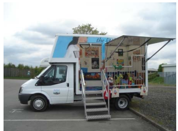
President's Shield for Best Small Van Sheffield's 'Play pen'