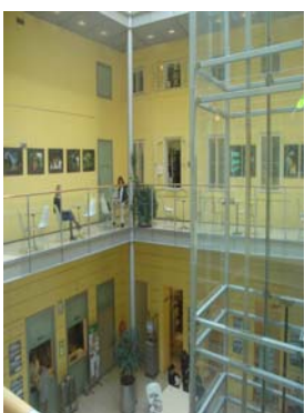
The very impressive Brno Library

Elina and Ari, library staff from Tampere, Finland, travelled three days and drove the famous Netti Nysse to Milano travelling over 5000 kilometres including the return journey. Delegates who had seen the vehicle previously could view how the vehicle and the programs offered from Netti have been adapted to residents' needs.