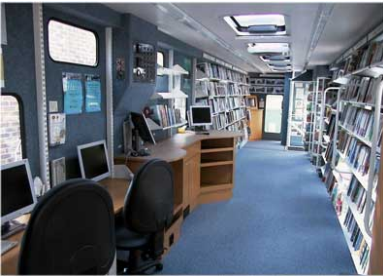
Interior East Riding Mobile Library