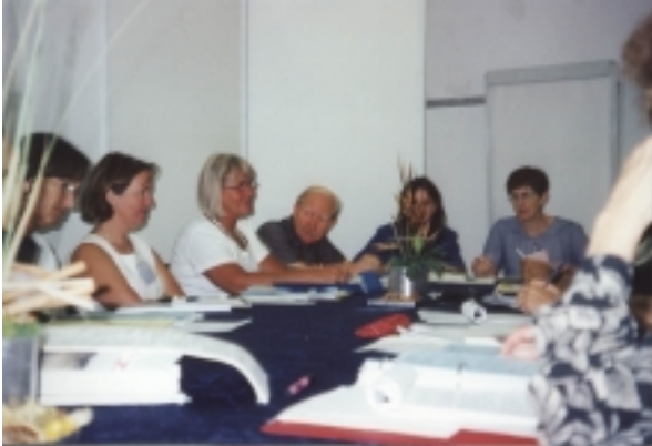
Members from Denmark, Norway, Sweden, Germany, France and United States